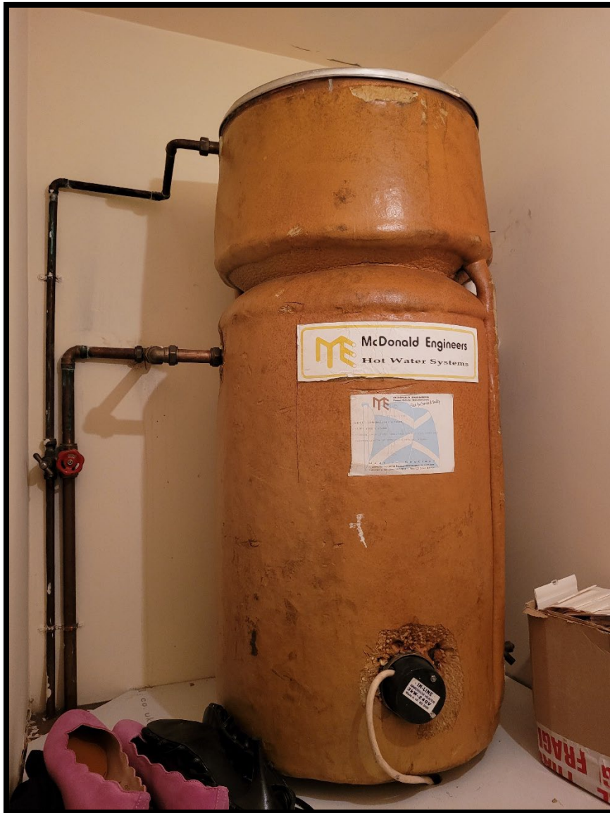
Photograph 20 Airing Cupboard – Replacement water tank