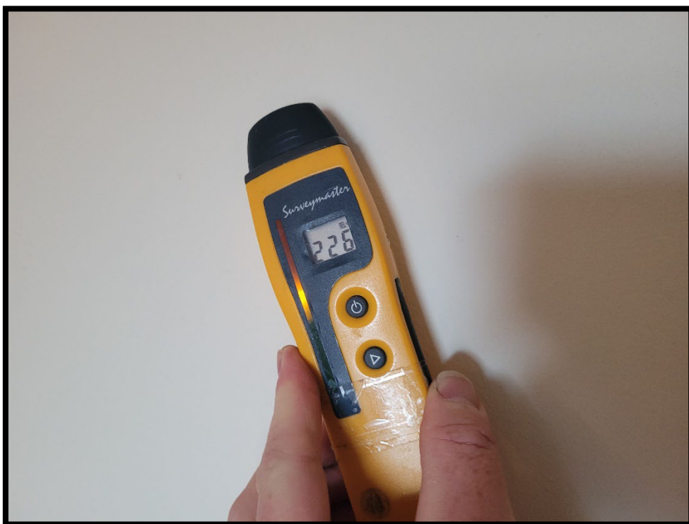
Photograph 4 Lounge – moisture reading 22.6%