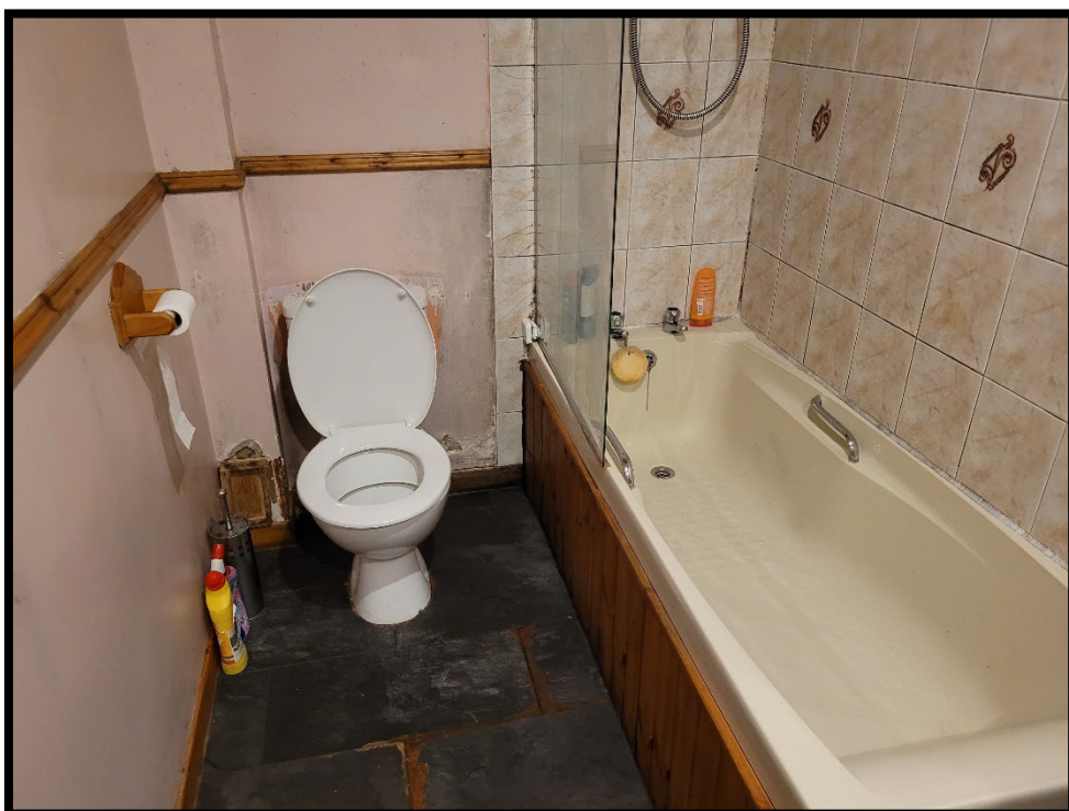
Photograph 13 Bathroom – Overview