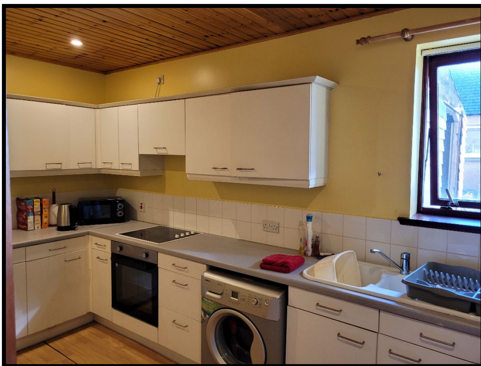
Photograph 16 Kitchen – Overview