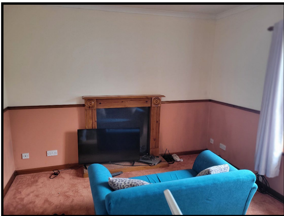
Photograph 2 Lounge - overview