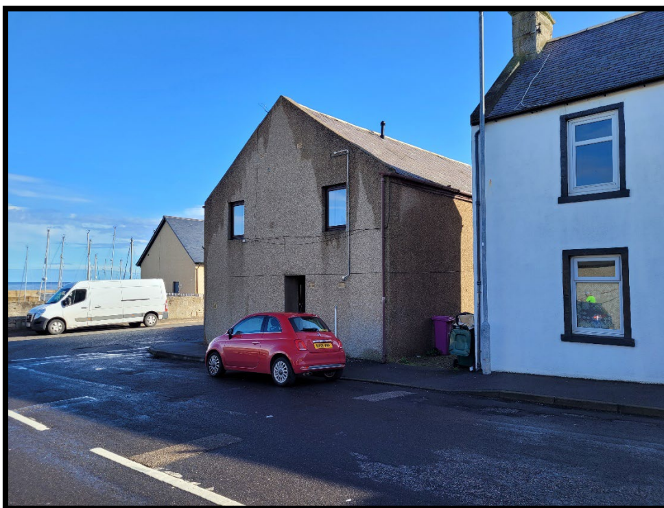
Photograph 1 West Elevation/King Street.