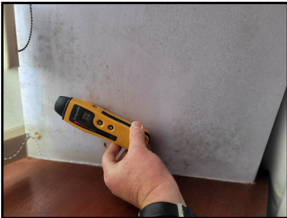
Photograph 8 Bedroom 1 – Window ingoe moisture reading 99.9%