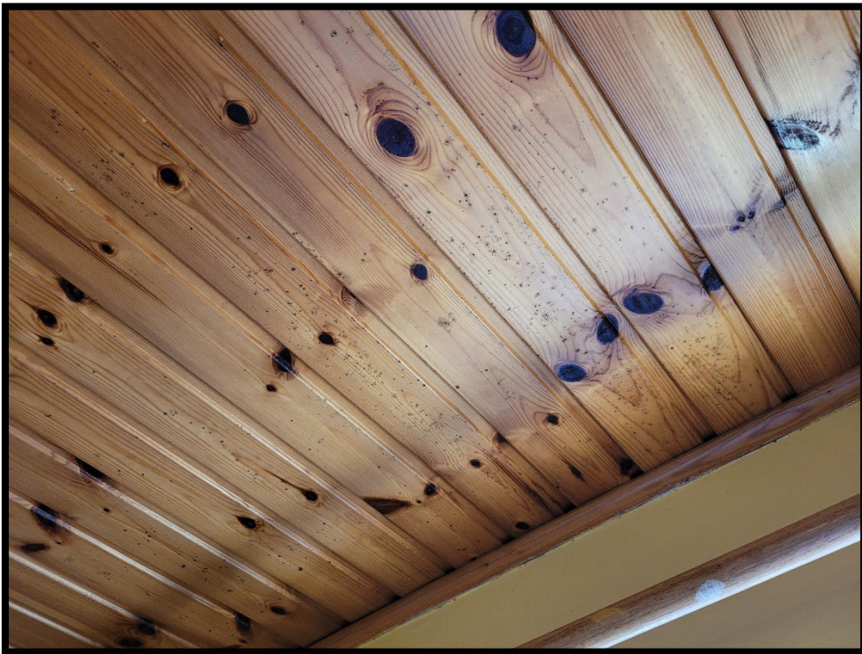
Photograph 19 Kitchen – slight mould to pine ceiling