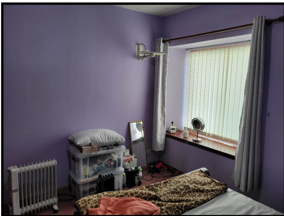
Photograph 7 Bedroom 1 - overview.