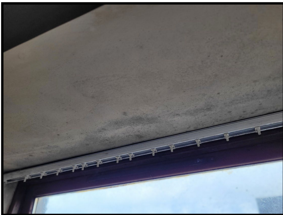
Photograph 9 Bedroom 2 – Window soffit and blind track