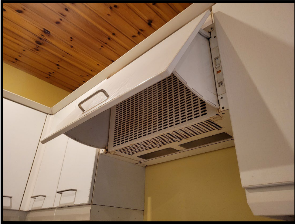
Photograph 18 Kitchen – cooker hood