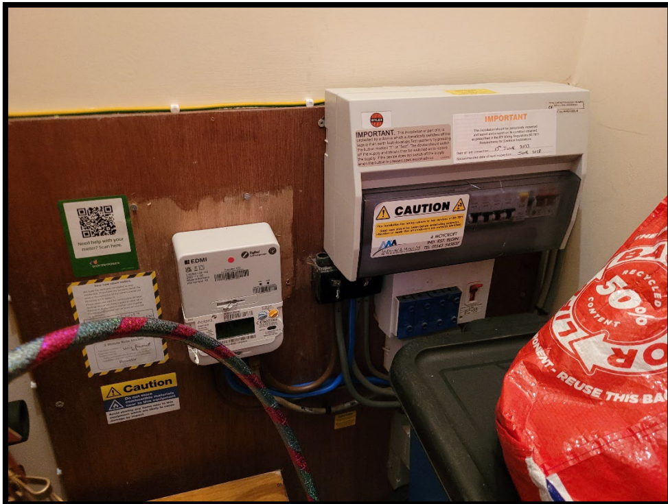
Photograph 21 Airing cupboard – electrical switchgear