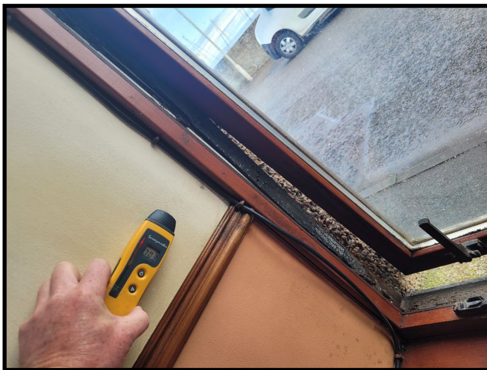
Photograph 5 Lounge – Moisture reading 70.3%.