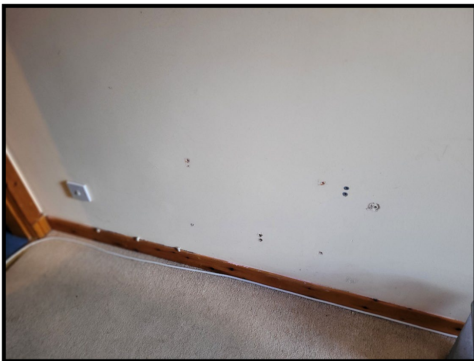
Photograph 12 Bedroom 2 – Site of electric heater, holes to wall, trailing cable to dehumidifier