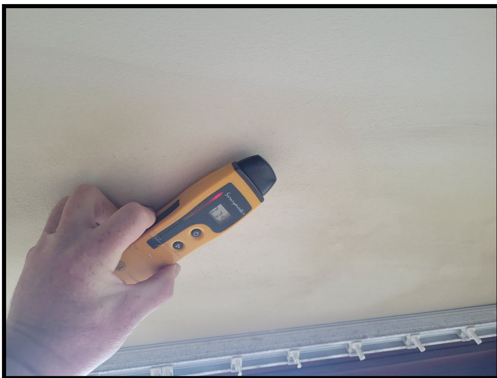
Photograph 6 Lounge – Window soffit moisture reading 77.9%