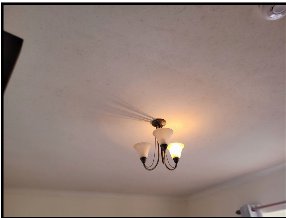
Photograph 3 Lounge - Mould to ceiling, smoke alarm.