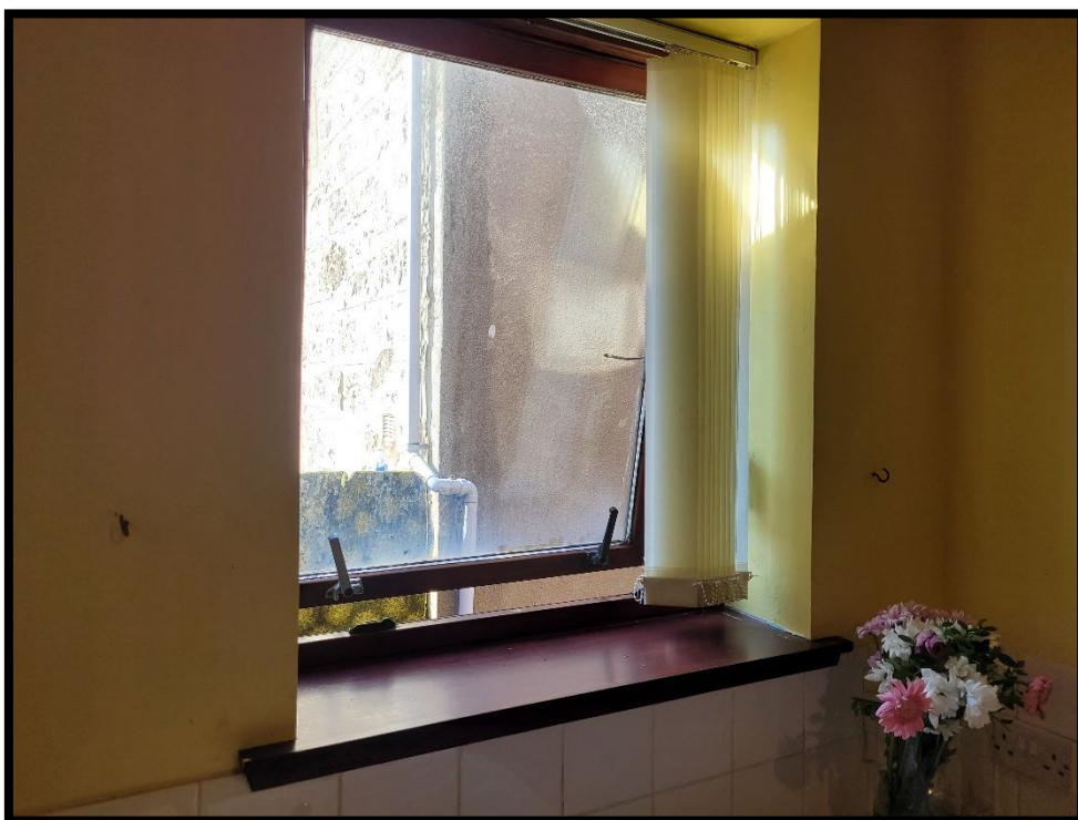
Photograph 17 Kitchen – Window