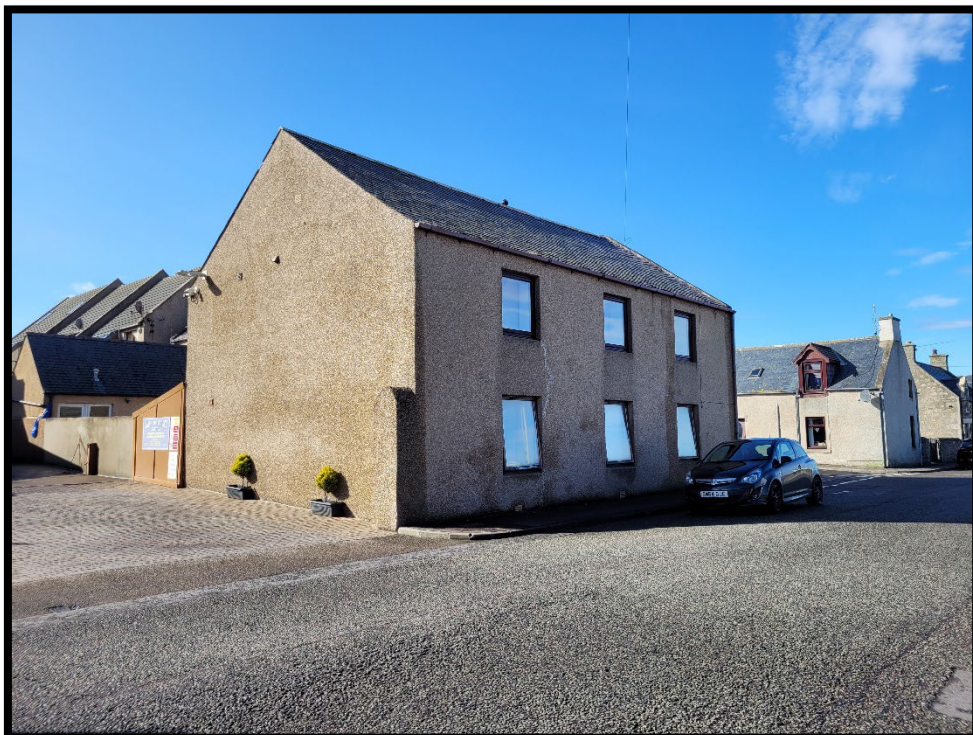
Photograph 22 North and East Elevations – vegetation growth to left side of gutters and water marks to walls below gutters left side of lounge window and at right corner.