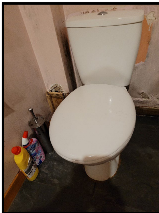
Photograph 14 Bathroom – Damaged wall at WC