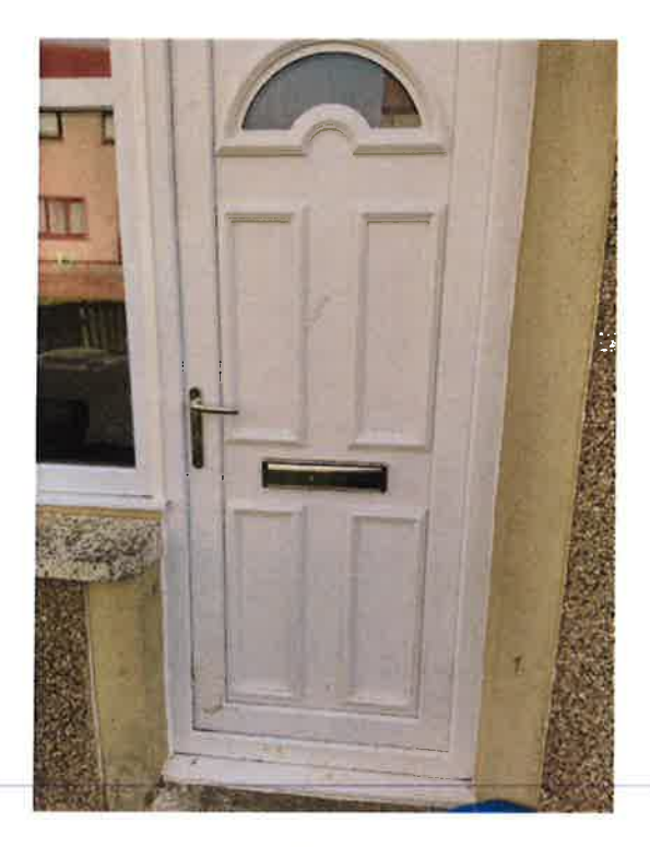
Damaged and insecure front door - March 2017