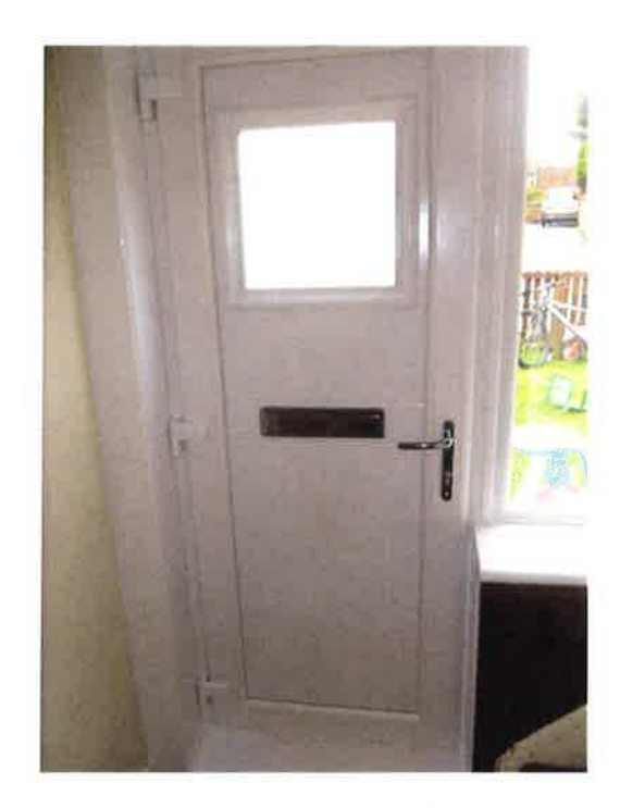
Replacement front door - June 2017