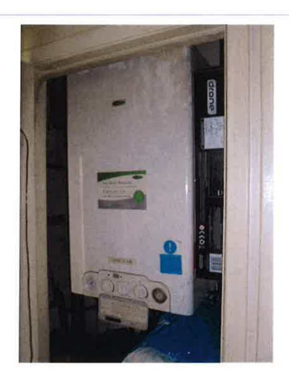
Gas Boiler - June 2017