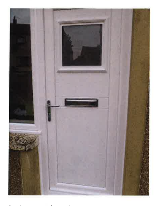
Replacement front door - June 2017